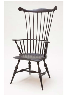
Handmade Windsor Arm Chair